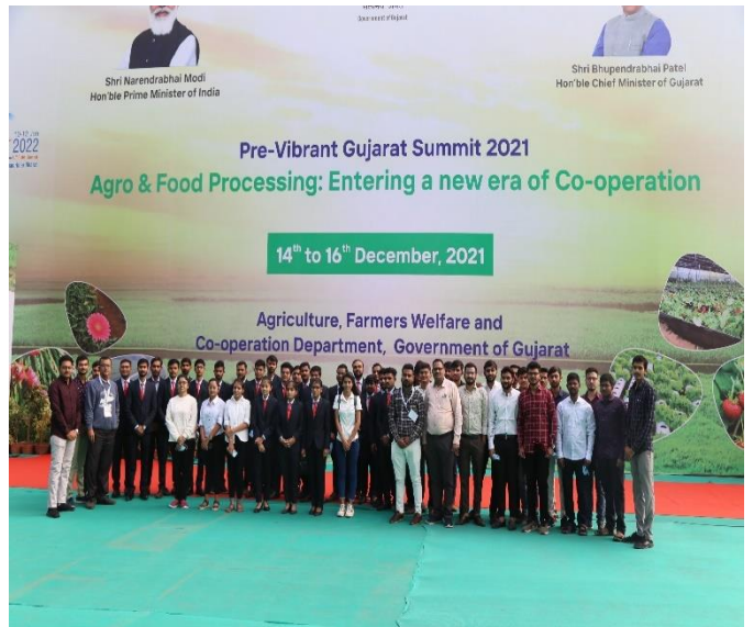
IABMI STUDENTS VISITED PRE-VIBRANT GUJARAT SUMMIT 2021