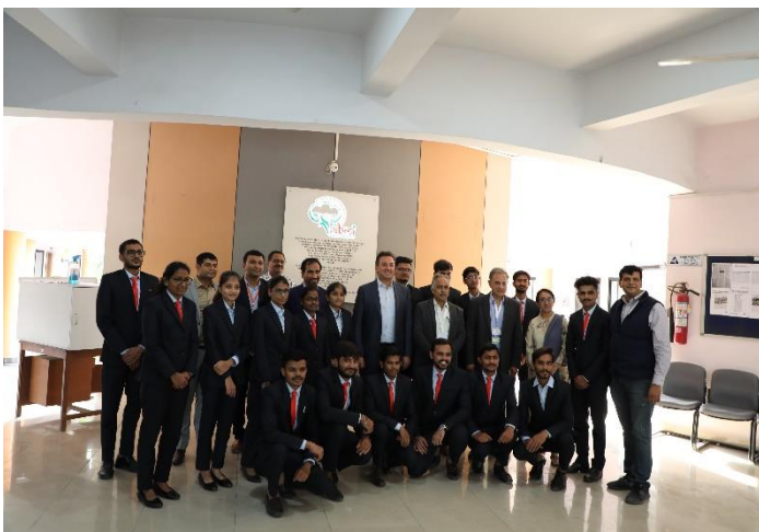
INDUSTRIAL OFFICIALS VISIT TO IABMI