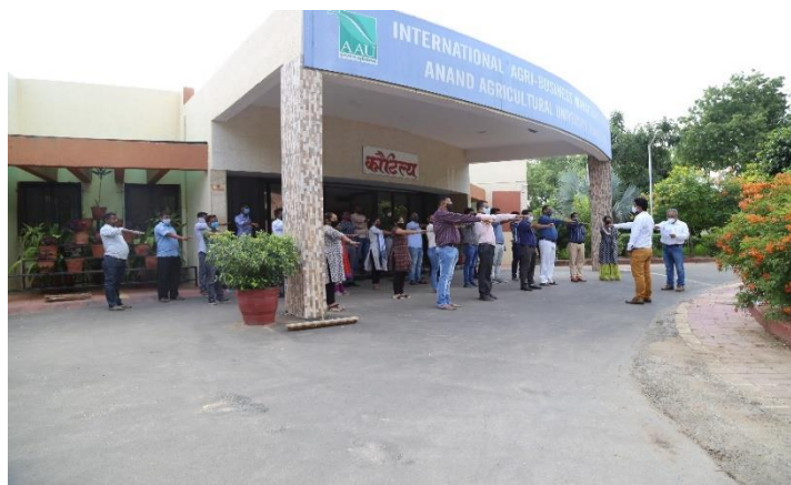
SWACHHATA PAKHWADA PROGRAMME AT IABMI