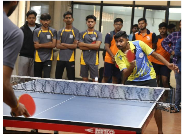
IABMI RUNNERS UP IN TABLE TENNIS