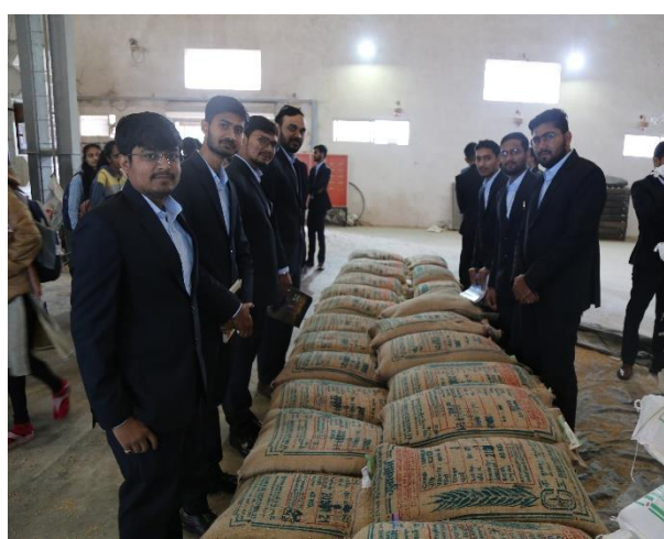
INDUSTRIAL VISIT OF THE IABMI STUDENTS