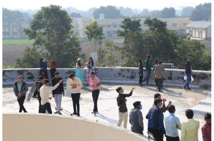
KITE FESTIVAL CELEBRATED AT IABMI