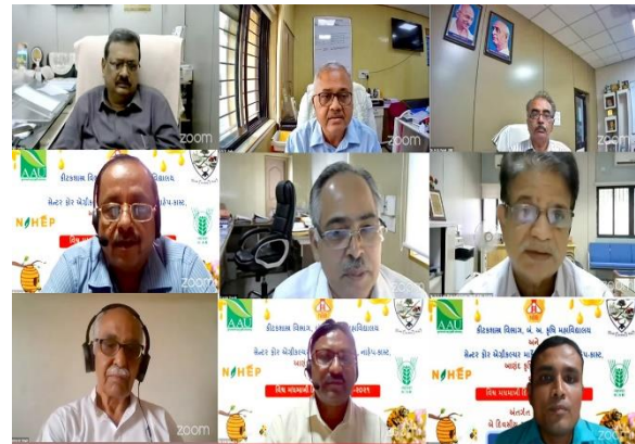
Webinar on Madhmakhi Palan