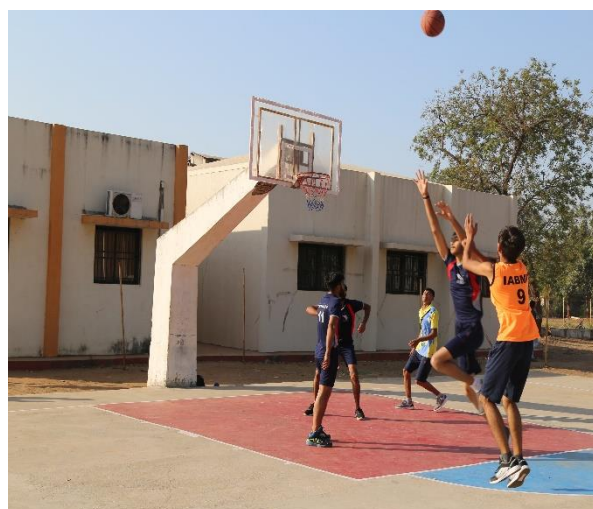
IABMI RUNNERS UP IN BASKET BALL