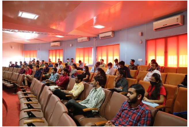
ORIENTATION PROGRAMME AT IABMI, AAU