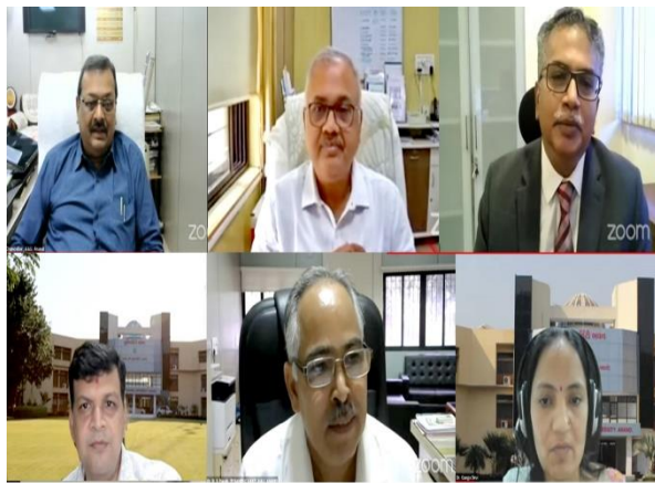
Webinar on Prospects and Functioning of Commodity Markets in India