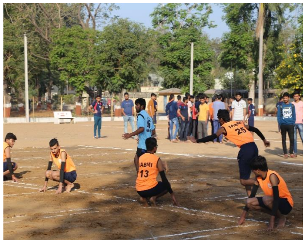
IABMI ORGANISED INTERCOLLEGIATE KHO-KHO COMPETITION