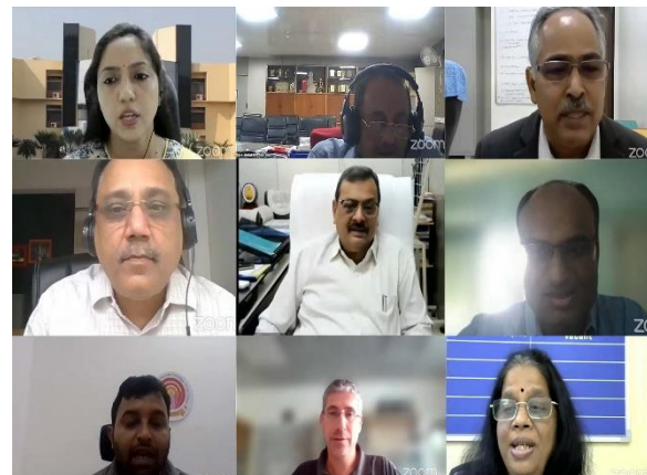
Webinar on Remote Sensing and Machine Learning Technology for Precision Farming