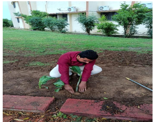
TREE PLANTATION AT IABMI