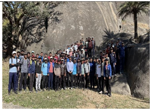
Basic Rock Climbing camp at Mt. Abu for Girls Students