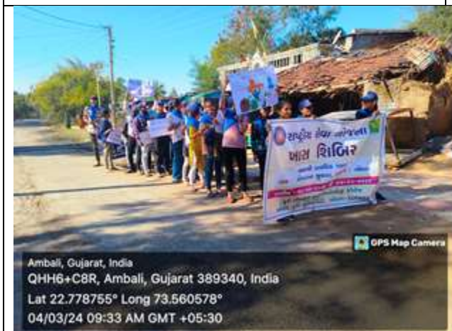
Ambali, Gujarat, India QHH6+C8R, Ambali, Gujarat 389340, India Lat 22.778755° Long 73.560578° 04/03/24 09:33 AM GMT +05:30