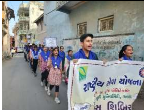
Cleanliness Awareness Rally