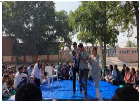
Drama for Awareness of Anti Drug to school kids