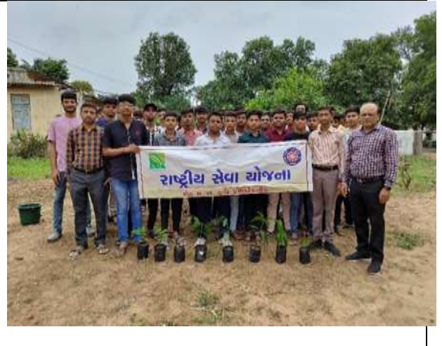
(13) Celebration of 'Meri Maati Mera Desh' Campaign