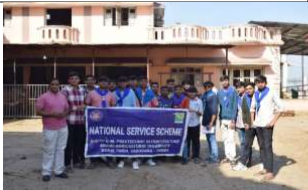
Special Camp at Vadtal