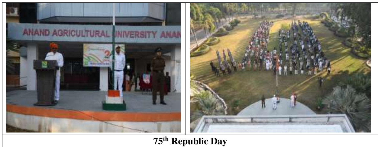
75 th Republic Day