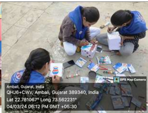
Ambali, Gujarat, India QHJ6+CWV, Ambali, Gujarat 389340, India Lat 22.781067° Long 73.562231° 04/03/24 06:12 PM GMT +05:30