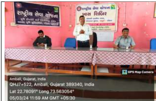
Ambali, Gujarat, India QHJ7+522, Ambali, Gujarat 389340, India Lat 22.78091° Long 73.563054° 05/03/24 11:59 AM GMT +05:30