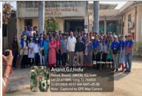
Special Camp at Dharmaj