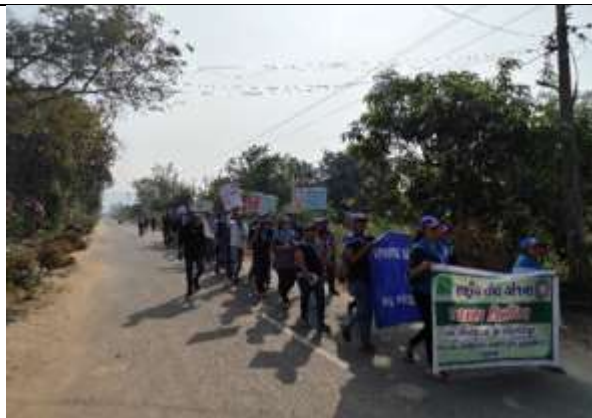
Special Camp at Chichod