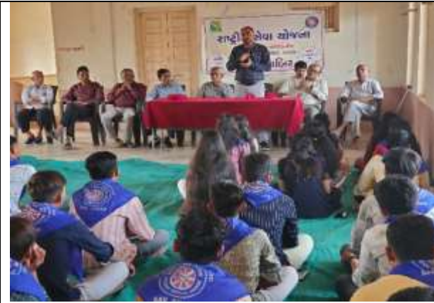
Special Camp at Navli

spiritual and cordial relationship, preservation of natural resources and conservation of cultural/historical heritage, animal health, dairy products, etc and strengthened their creativity.