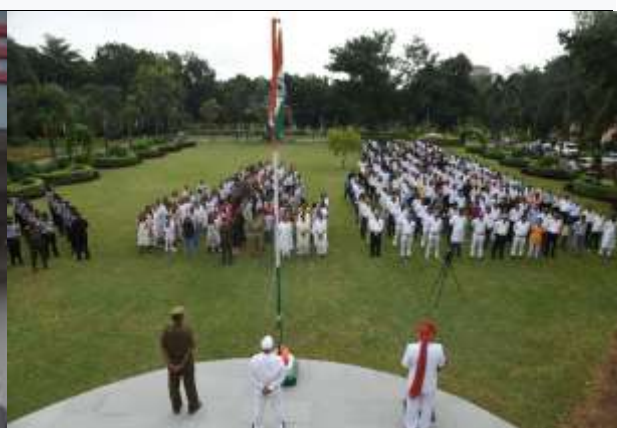
77 th Independence Day