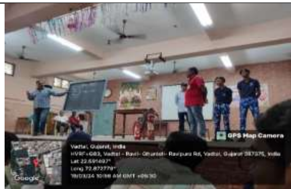
Fire Safety Training