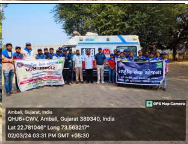
Ambali, Gujarat, India QHJ6+CWV, Ambali, Gujarat 389340, India Lat 22.781046° Long 73.563217° 02/03/24 03:31 PM GMT +05:30