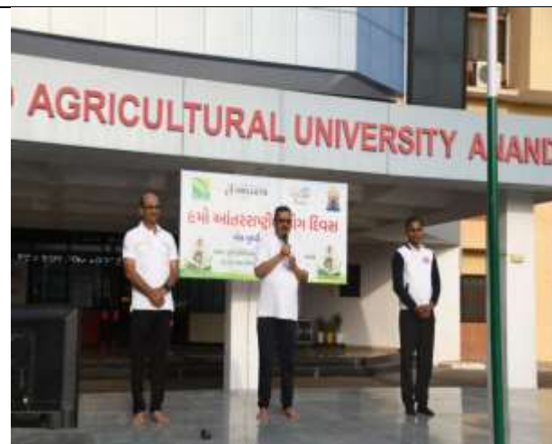
International Day of Yoga